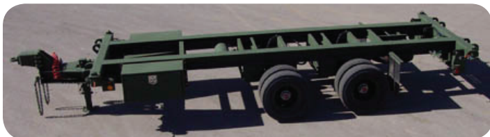
ISO Mobility Trailer is available in 15,000 lb., 18,000 lb., and 28,000 lb. payload capacity