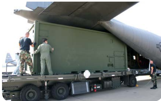
20-Foot ISO Shelter being loaded onto an aircraft