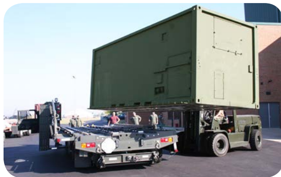
20-Foot ISO Shelter being fork lifted onto a K-Loader