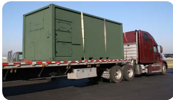
20-Foot ISO Shelter positioned on a flatbed truck for transport