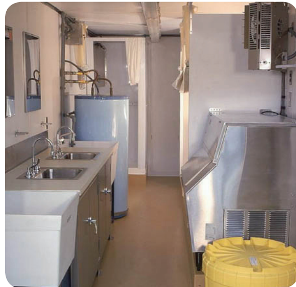
Medical Utility Facility