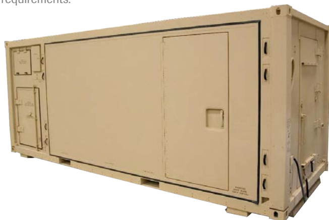
Expandable 20-foot ISO Shelter in stowed position

*Product in development. **Dimensions and weights listed are typical. Actual dimensions and weights may vary based on customer requirements.