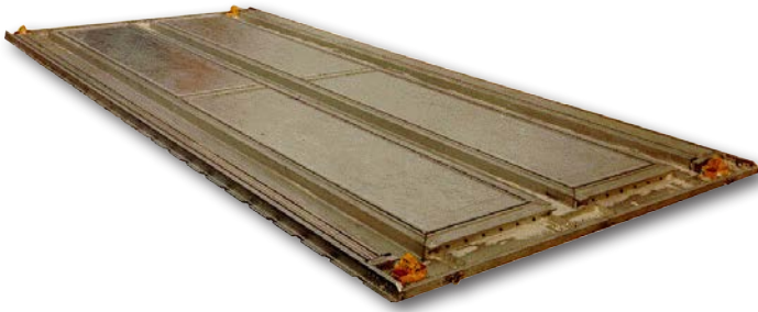
Airliftable 20-Foot ISO Adapter Pallet