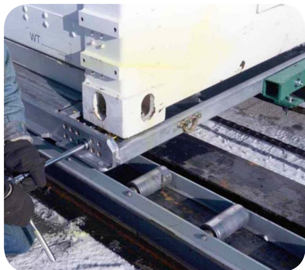
Quick attachment of container to the pallet