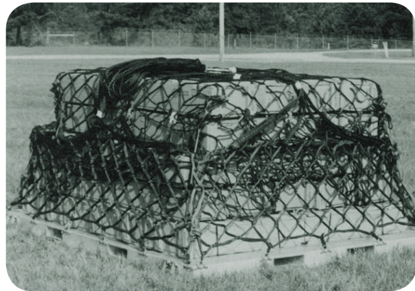
INTEX Pallet shown with cargo secured with net