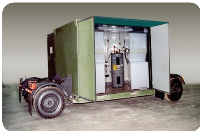
Self-contained ISU® 90 Laundry Unit shown with optional High Speed Mobility Wheel Set (P/N 60340-002)