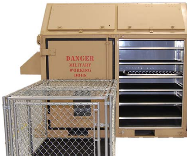
ISU® 90KCI Dog Kennel shown in use