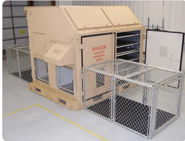
ISU® 90KCI Three Dog Kennel shown with chain link dog runs and matting in place