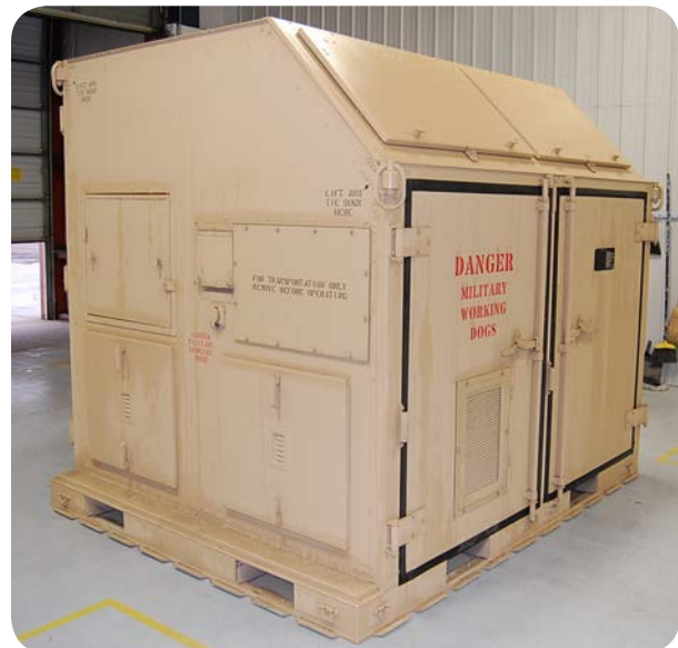
ISU® 90KCI Three Dog Kennel shown stowed and ready for deployment