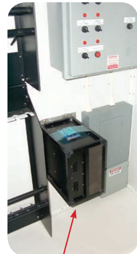
HSC with dehumidifier