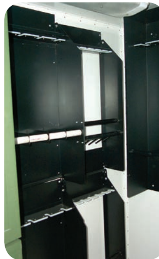
Optional weapons racks