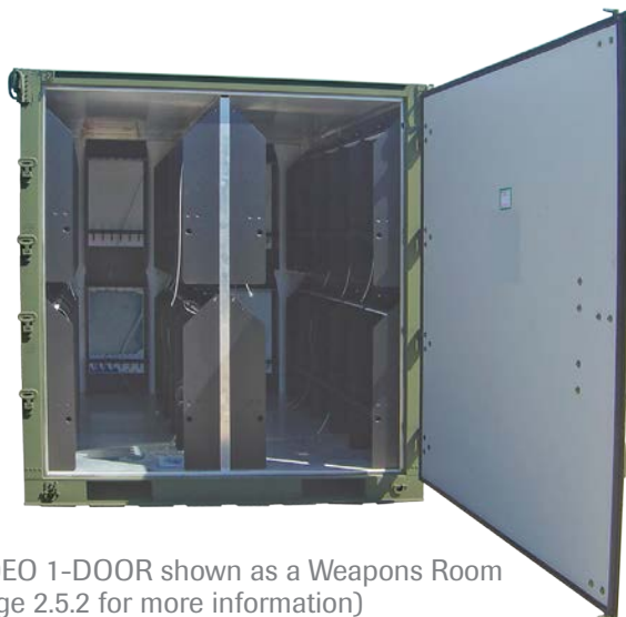
ISU® 90EO 1-DOOR shown as a Weapons Room (see page 2.5.2 for more information)

*Above part numbers are for containers only; no accessories