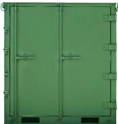
War Readiness Spare Kit (WRSK) Storage Container single door end with dual lock rods