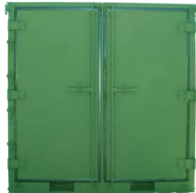
War Readiness Spare Kit (WRSK) Storage Container double door end

*Above part numbers are for containers only; no accessories