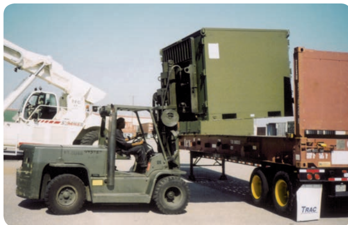
ISU® 80 shown being forklifted onto a flatbed truck

*Above part numbers are for containers only; no accessories