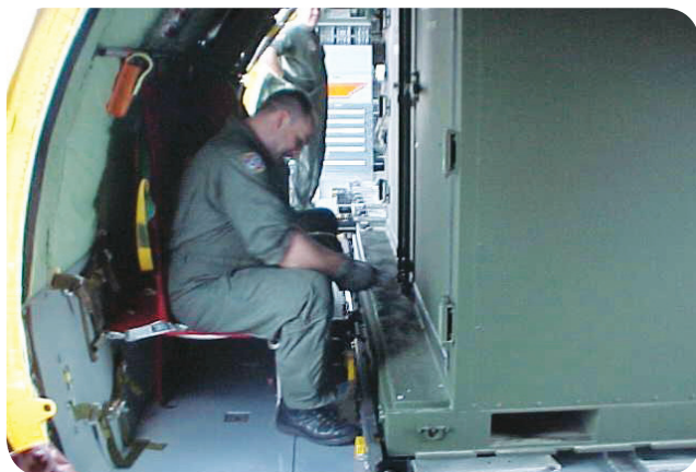
ISU® 70KCA with 8" aisleway making room for seats

*Above part numbers are for containers only; no accessories