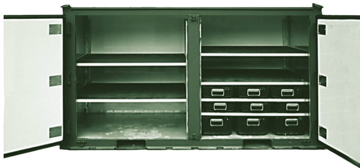
ISU® 60 shown with optional shelves and trays

*Above part numbers are for containers only; no accessories