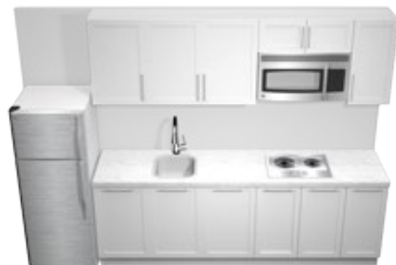
Extended kitchen with counter and built-in cabinets.