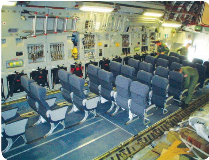
View of C-17 showing dual passenger/cargo configuration