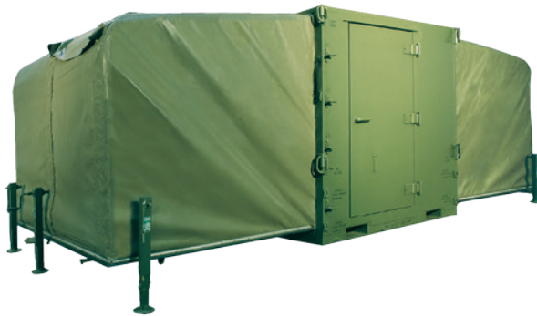
EMSC fully expanded