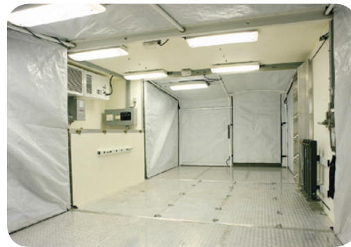
Interior view of the expanded EMSC