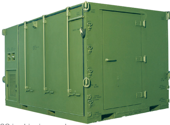
EMSC in shipping mode