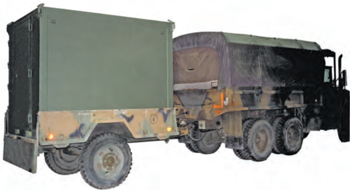
M105 TSC shown loaded onto a standard M105 Trailer