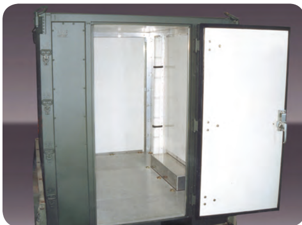
Interior of M105 Trailer Shop Container