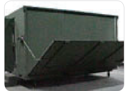
HELAMS being expanded to full size; HELAMS front and back.