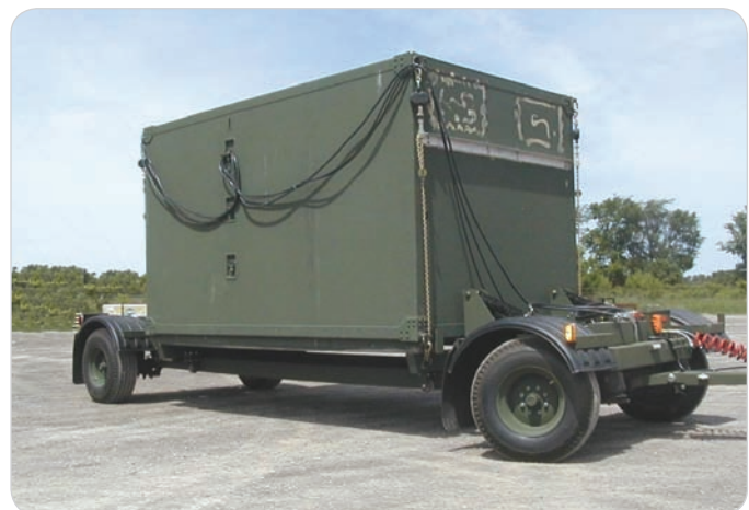
View of HSMWS (P/N 60340-008) attached to a LAMS - Light Air Mobile Shelter.

P/N: 60340-007 NSN: 8145-01-490-3761 S-280 HSMWS Adapter Frame Kit. H-Bar Frame includes steps for rear entry.