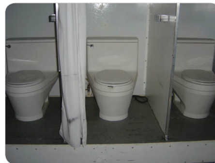
Interior view of latrine stalls.