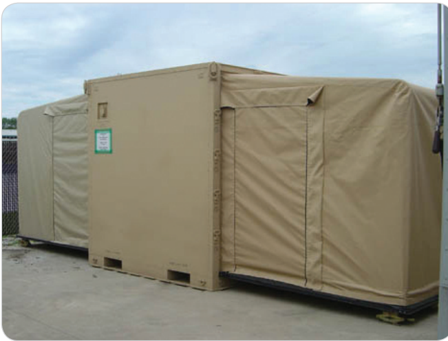
3-in-1 expandable EISU shelter fully deployed.

AAR Sacramento (Cage Code 1DUG2): P/N: 56140-732 - forest green P/N: 56240-732 - desert sand P/N: 61201-0003 - green camo