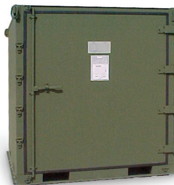
Front View of closed ISU-90EO MRSP.