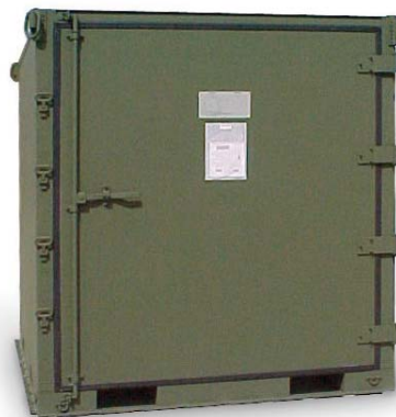
Front View of closed ISU-90EO MRSP.