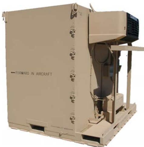
Side view of ISU® 96RC Diesel Refrigerated Insulated Container