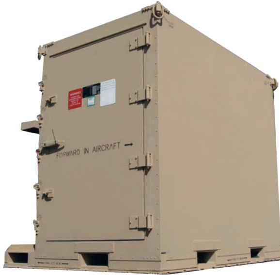
ISU® 96RC Diesel Refrigerated Insulated Container