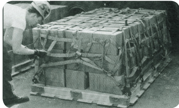
463L HCU-10/C Pallet shown with cargo and net